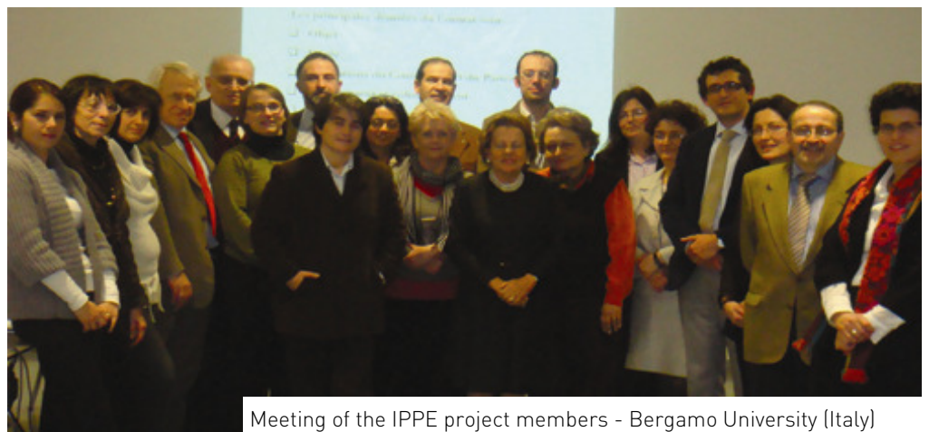
Meeting of the IPPE project members - Bergamo University (Italy)

The so-called « collective rights » consist mainly of the right to participation for parents in the organized formal structures of the education system.